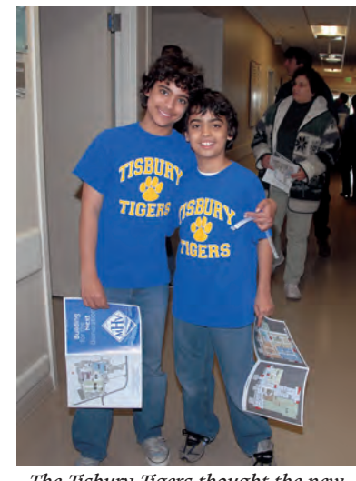
The Tisbury Tigers thought the new hospital was a winner!