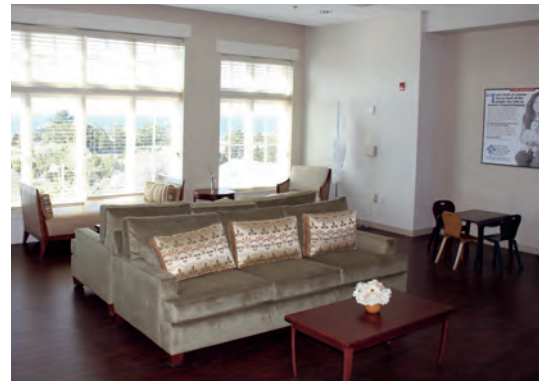
Waiting area outside of maternity is comfortable for family and friends.