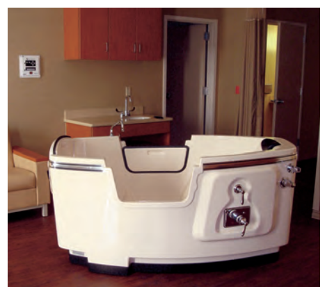
Two new birthing tubs are available for moms in labor.