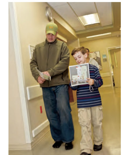
Maps in hand, two generations tour the new hallways.