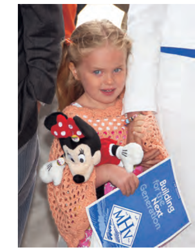
Glimpsed among many other celebrities, a famous mouse and her best friend explore the Hospital.