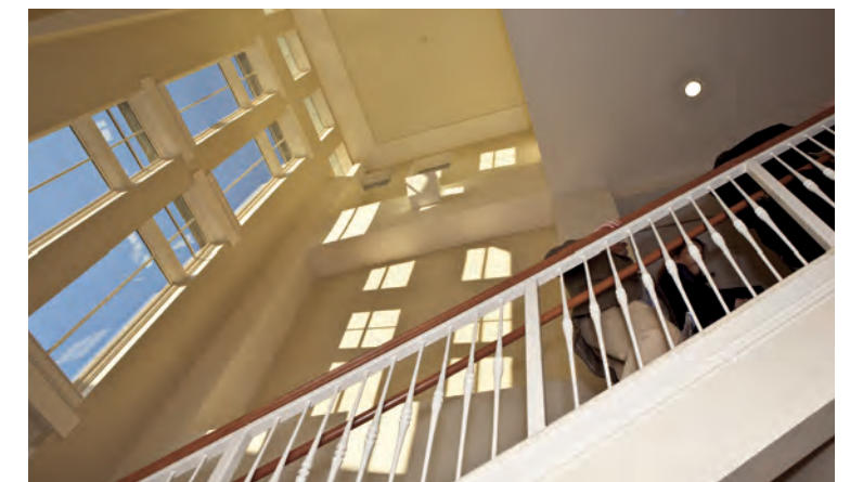
Letting in the Light; use of natural light was a priority in the overall design.