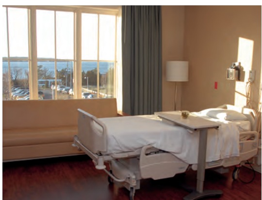
A typical patient room has a view of Vineyard Haven Harbor or the Roof Garden.