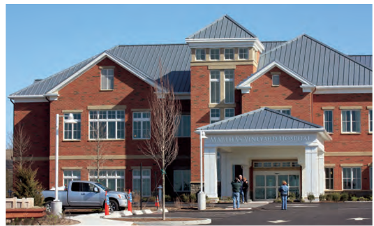
Environmentally sensitive design includes a healing Roof Garden, a significant element in our philosophy of patient-centered care.