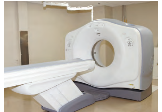
New GE 64-slice wide bore CT scanner includes technology that reduces radiation exposure by as much as 40%.