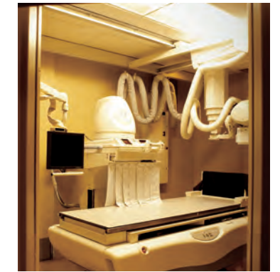
New radiology equipment from GE.