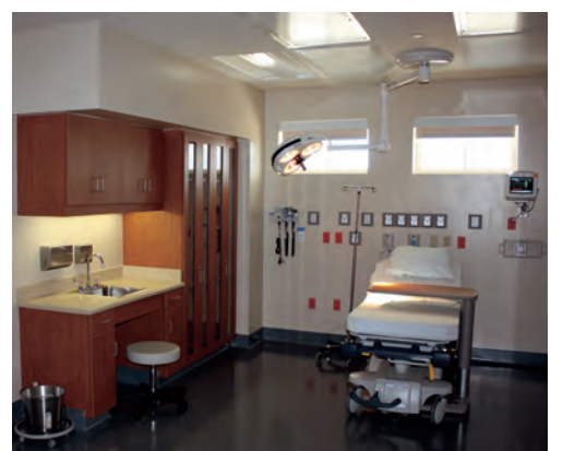
Emergency Services department trauma room.