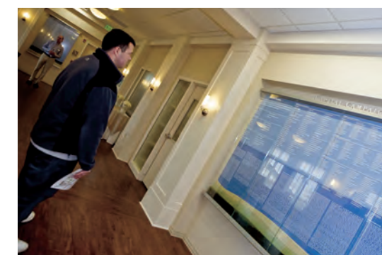
The donor wall in the new lobby is inscribed with the names of more than 1,800 contributors in recognition of their generous support.