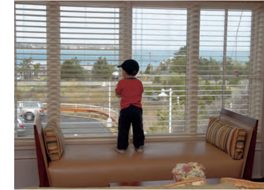
The next generation enjoys the view of the harbor from the second floor waiting area.