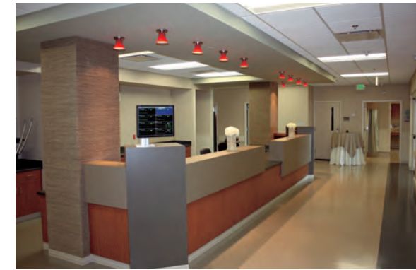
Emergency Services department has 16 patient rooms and offers more privacy for all patients.