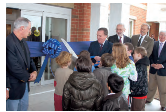
Children from the community were invited to cut the ceremonial ribbon.