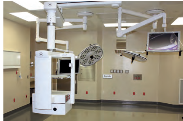
One of two state-of-the-art operating suites will be digitally connected to Massachusetts General Hospital.