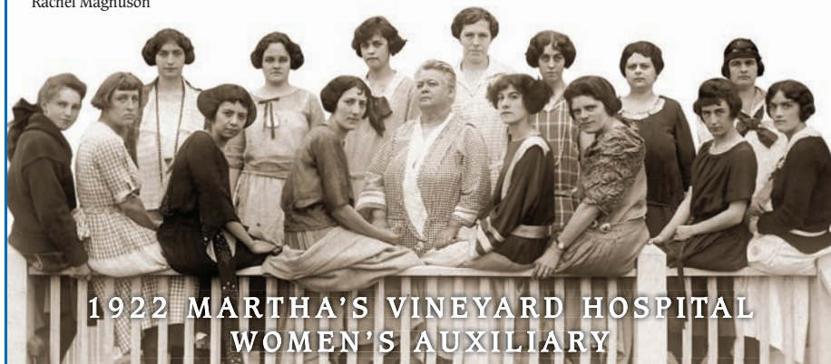
1922 MARTHA'S VINEYARD HOSPITAL WOMEN'S AUXILIARY